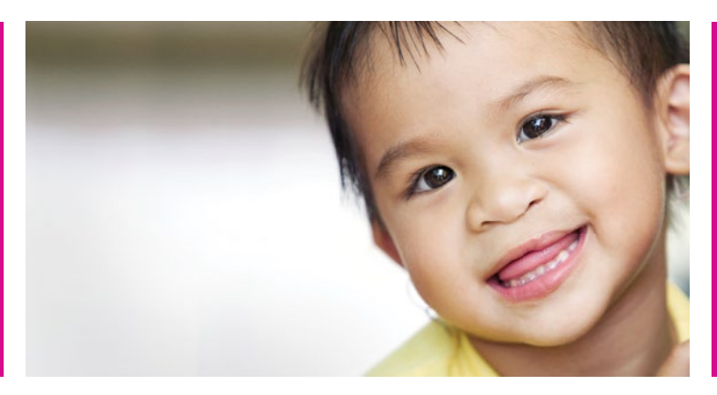
Since 1993, Abbott and the Abbott Fund have donated more than USD9 million (VND 187.2 billion) in grants and products to support the work of Operation Smile in correcting children's facial deformities. Since 2005, with Abbott's donation of anesthesia, Operation Smile has completed more than 100 medical missions that have provided Vietnam with more than 8,000 successful surgeries.